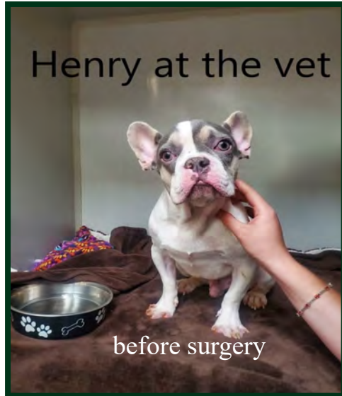
Henry at the vet