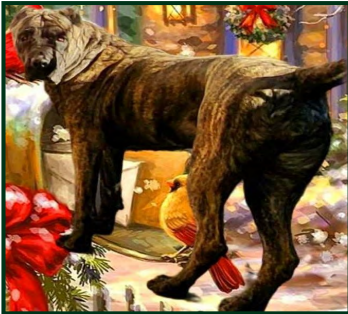
This beauty is Sunshine another face of the desert. She is a Cane Corso and a very sweet girl.