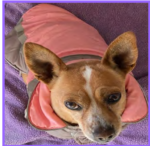
Chiquita, keeping warm in a cold day in the high desert!