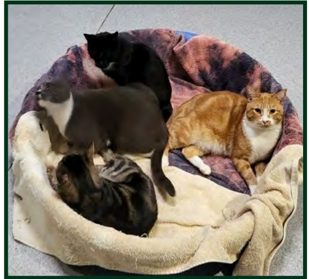
Some of our rescued kitties ready for a nap in a cold and rainy day!