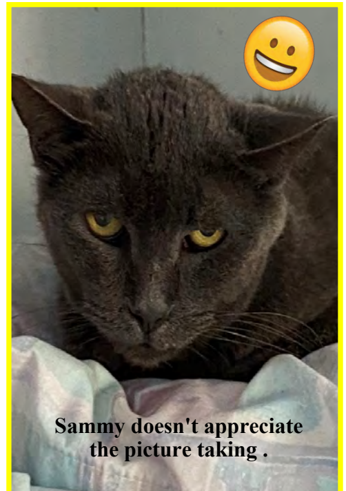
Sammy doesn't appreciate the picture taking .