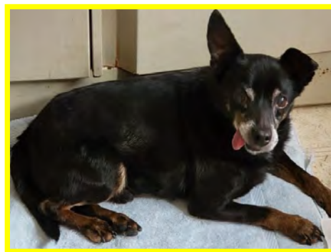
Rudy, one of our little seniors!

OUR RESCUED ANIMALS NEED YOUR HELP! PLEASE DONATE TO CARE!