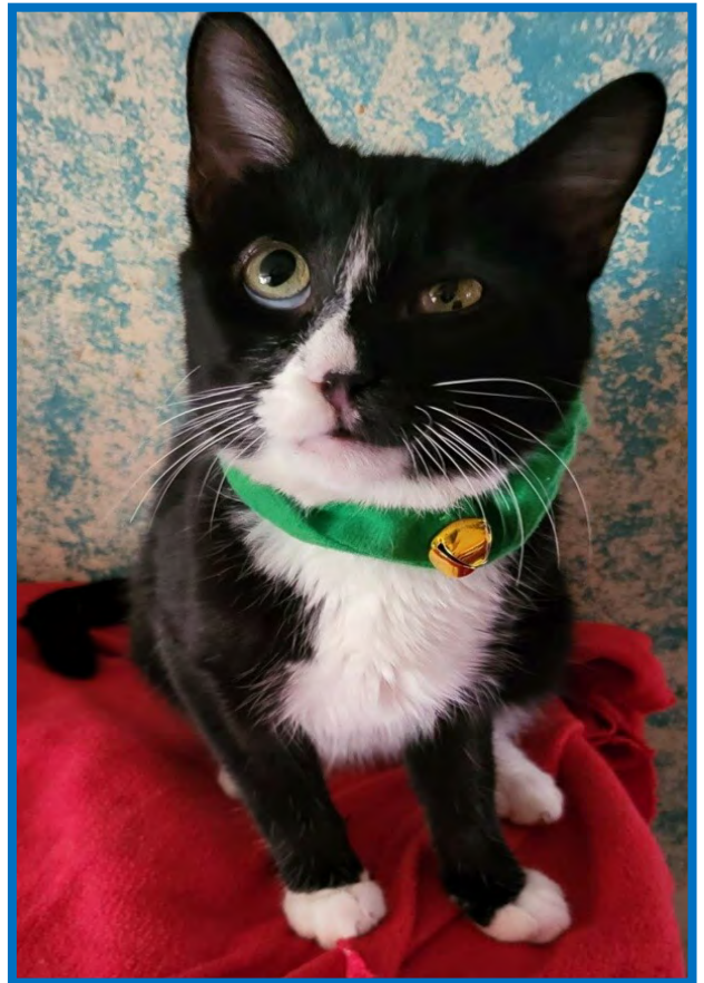
This beautiful tuxedo kitty is Simba. He is vision impaired in one eye. He is ready for his forever home!