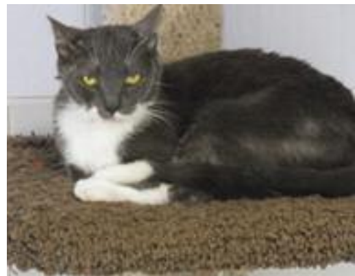
Anita - Oh no... The Paparazzi "again!"