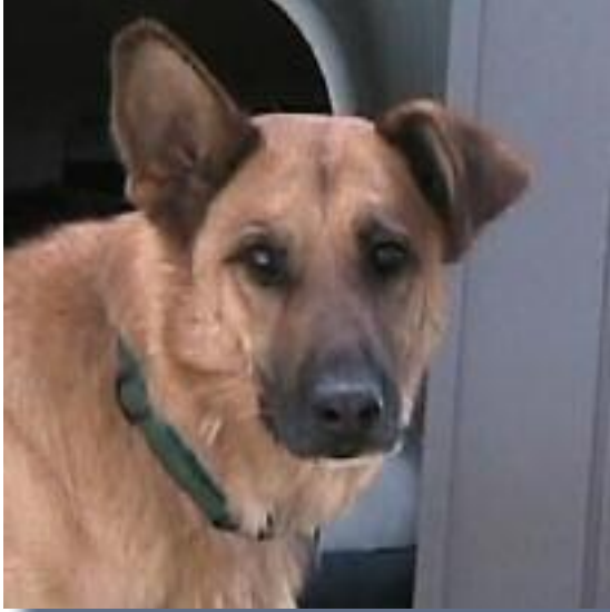
Titus and the 200 plus residents at the C.A.R.E. sanctuary need your help

NON PROFIT U.S. POSTAGE PAID PERMIT #1 NO. HOLLYWOOD, CA